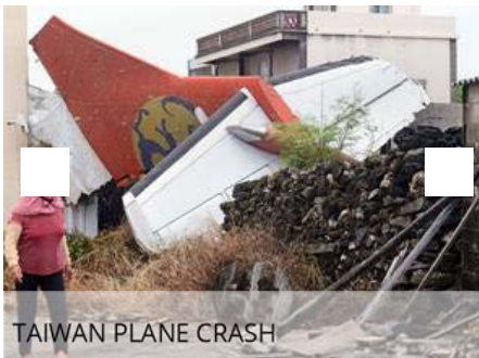
TAIWAN PLANE CRASH