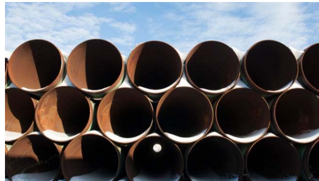
A depot used to store pipes for Transcanada Corp's planned Keystone XL oil pi...

WASHINGTON, Feb 24 (Reuters) - President Barack Obama on Tuesday swiftly delivered on his vow to veto a Republican bill approving the Keystone XL oil pipeline from Canada, leaving the long-debated project in limbo for another indefinite period.