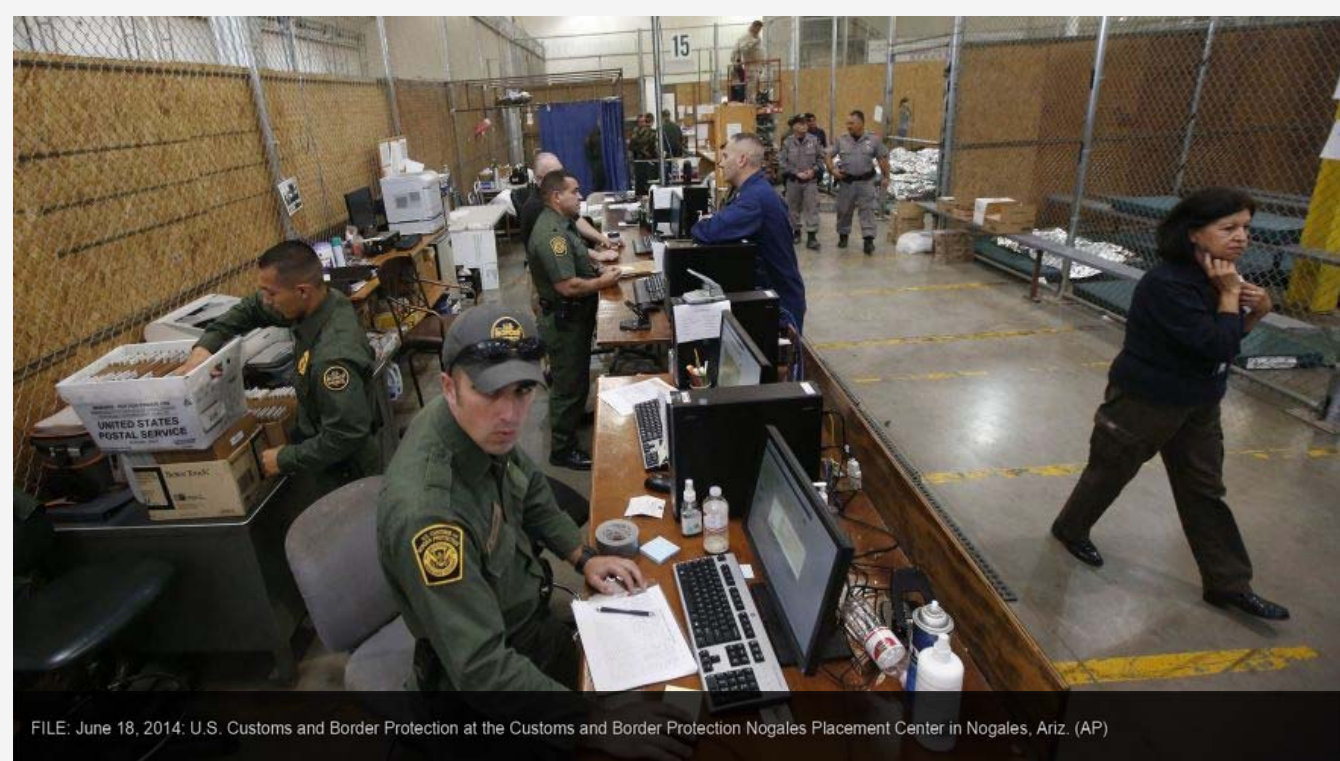
FILE: June 18, 2014: U.S. Customs and Border Protection at the Customs and Border Protection Nogales Placement Center in Nogales, Ariz.

The Obama administration has since 2009 issued roughly 5.5 million work permits to non-citizens beyond what Congress has authorized, according to recently-released documents that critics of U.S. policy say reveals a "shadow" or "parallel" immigration system stifling wages and taking jobs from Americans.