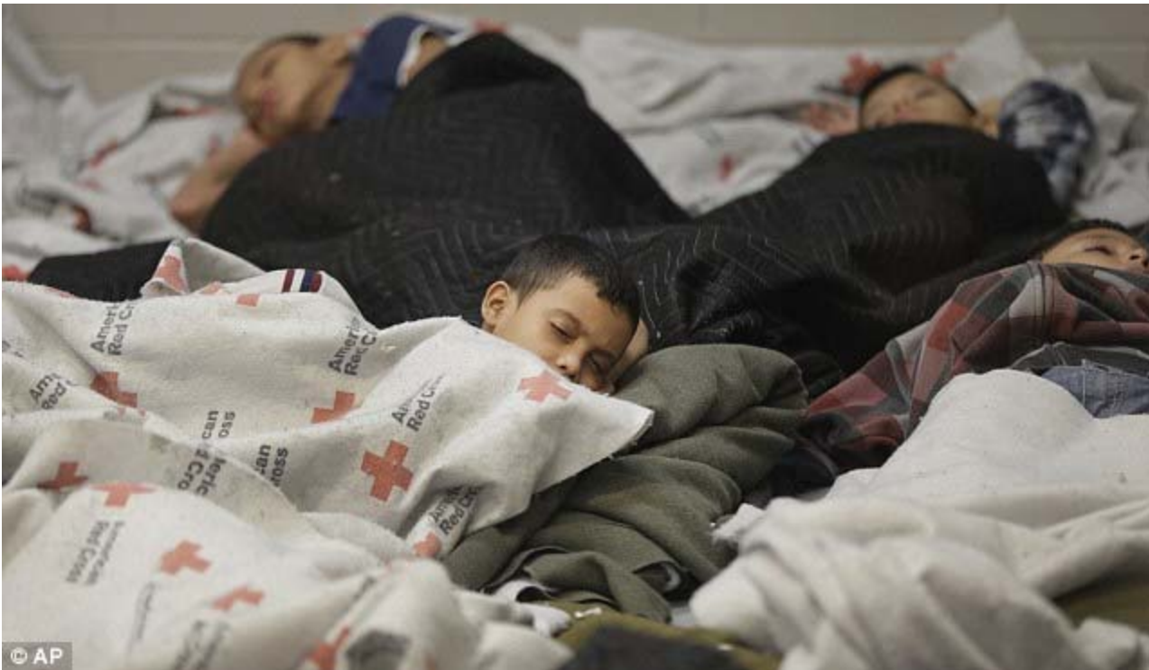
This June 18, 2014 photo shows illegal immigrant children sleeping on the floor of a holding cell at a U.S. Customs and Border Protection processing facility in Brownsville, Texas

would use its 'existing legal authorities' to enact its own reforms