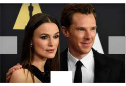
47 PHOTOS 2014 Honorary Oscars ceremony