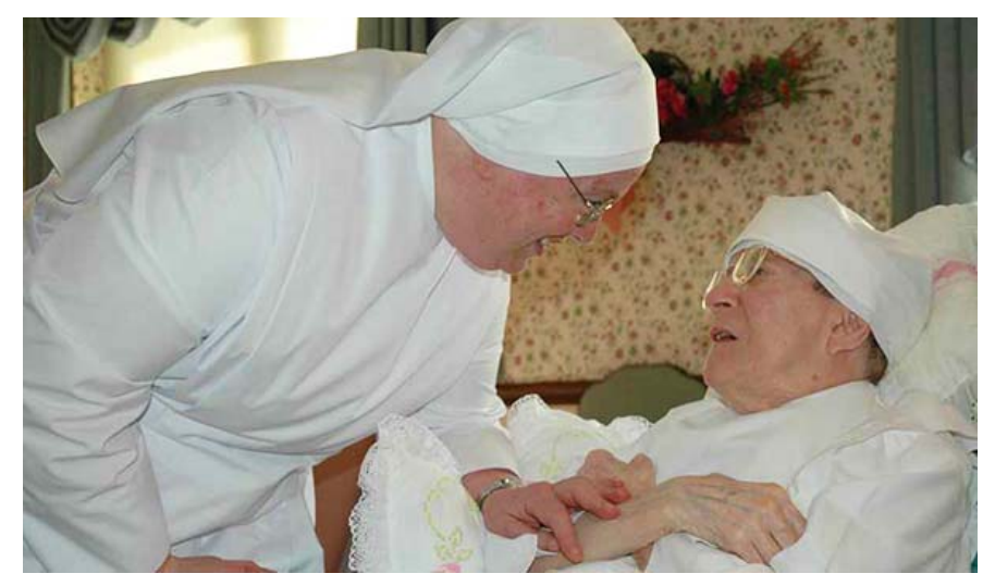
A member of the Little Sisters of the Poor tends to a patient.