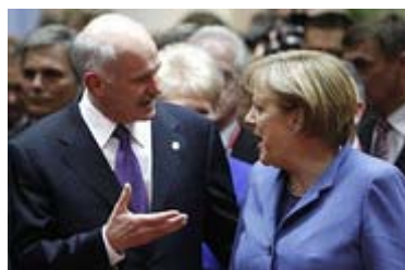
Debt talks: Greece's Papandreou, left, with Germany's Merkel.