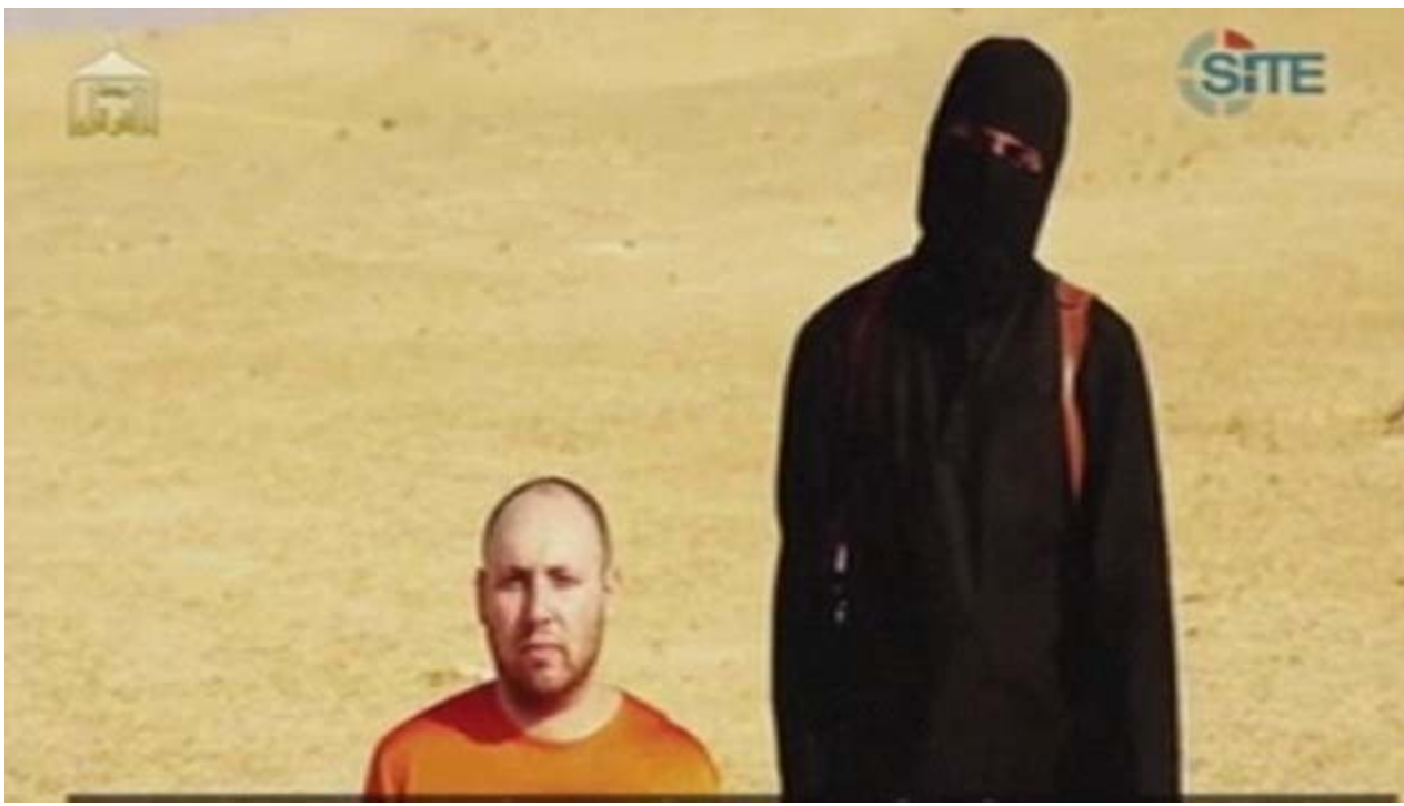
Mother appeals to ISIS leader to release her son