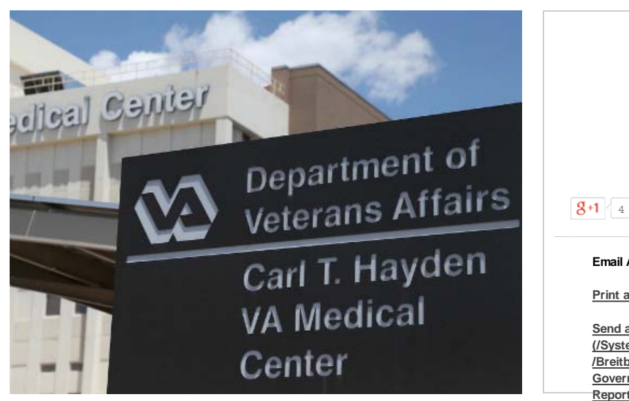
by CHARLIE SPIERING (/COLUMNISTS/CHARLIE-SPIERING) 28 May 2014, 12:34 PM PDT 666 POST A COMMENT (/BIG-GOVERNMENT/2014/05/28/IG-REPORT-VETERANS-WAITED-AN-AVERA DAYS-AT-PHOENIX-FACILITY#COMMENTS) Facility)

A new interim report from the Inspector General of the Department of Veterans Affairs confirms that veterans are being forced to wait an average of 115 days for care in a Phoenix Veterans Health Care facility - confirming media reports of a scandal in the department.