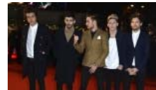
'One Direction' Boys Spotted Running Around Argentinian Hotel In Their Skives