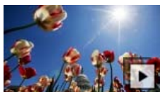
Best Pix Of The Week