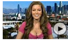
Viral video star Rebecca Grant has mini meltdown on camera