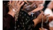
Millions Of Latinos Have Abandoned Catholic Church Since 2010, Pew Says