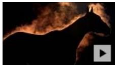
Best Sports Pix Of The Week