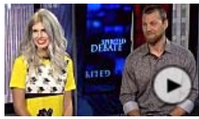
Tampa Bay Rays' Ben Zobrist shares his softer side