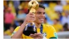
Same Old, Same Old Named To Brazil's World Cup Roster