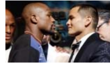
Maidana's Latest Punch: Mayweather Is A Baby Girl