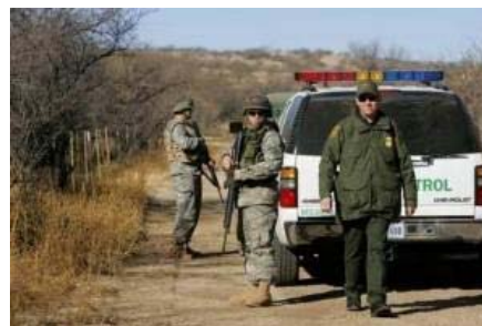
National Guard to end ground-based border surveillance

The ranks of the U.S. Border Patrol have doubled since 2004 to 21,444 agents with more than 18,000 of those agents stationed on the southwest border from Texas to California.