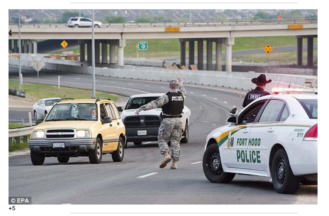
Lock down: Military police stop traffic on the way into the Texas base

'We don't yet know what happened tonight, but obviously that sense of safety has been broken once again.'