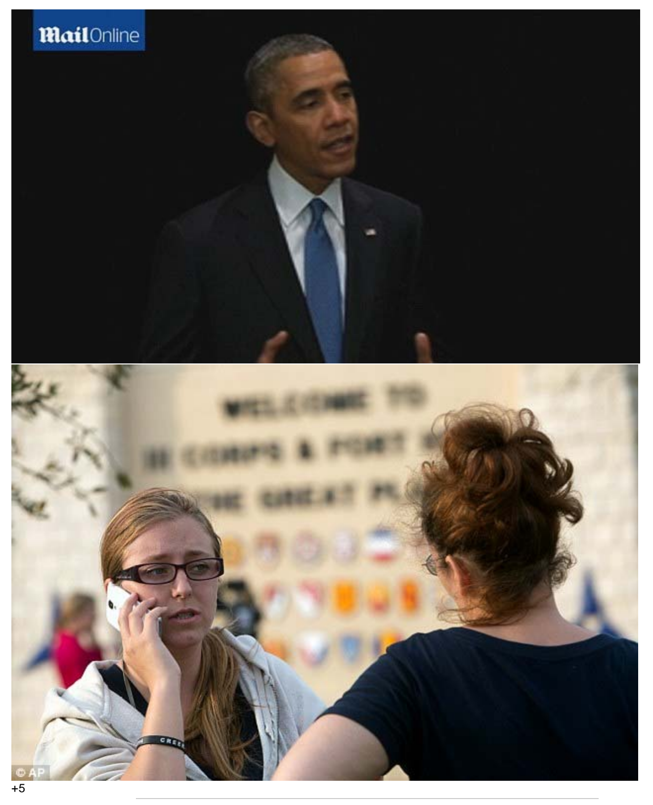
Concern: Military wives try to contact their husbands during the lock down at Fort Hood