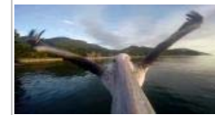
GoPro: Pelican Learns To Fly