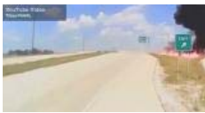
Flying, Flaming Semi Caught on Video!