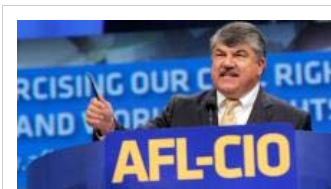
AFL-CIO President Richard Trumka.

The BLS bases its employment statistics on the civilian noninstitutional population, which consists of all people in the United States 16 or older who are not on active duty in the military or in an institution such as a prison, nursing home or mental hospital. The labor force participation rate is the percentage of people in the civilian noninstitutional population who either had a job or who actively sought one in the previous four weeks.