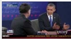
FNC Shows Flashback to Obama Ridiculing Romney: '1980s Are Calling to Ask for Their Foreign Policy Back'