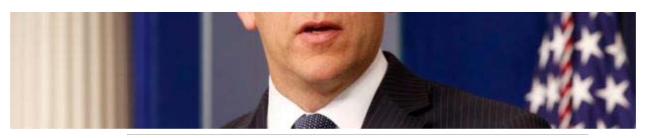
Jay Carney insisted in a press briefing that no administration employees had sought security clearances so they could testify about he Benghazi raid, even after the House Oversight Committee asked for those very clearances

Issa's committee has already shed public light on the U.S. State Department's denials of requests for more robust security at the consulate in Benghazi. And in an October 2012 hearing, it produced evidence contradicting the administration's initial claim that the Sept. 11, 2012 military-style assault on the diplomatic compound began as a 'protest' sparked by a low-budget YouTube video that lampooned the Muslim prophet Muhammad.