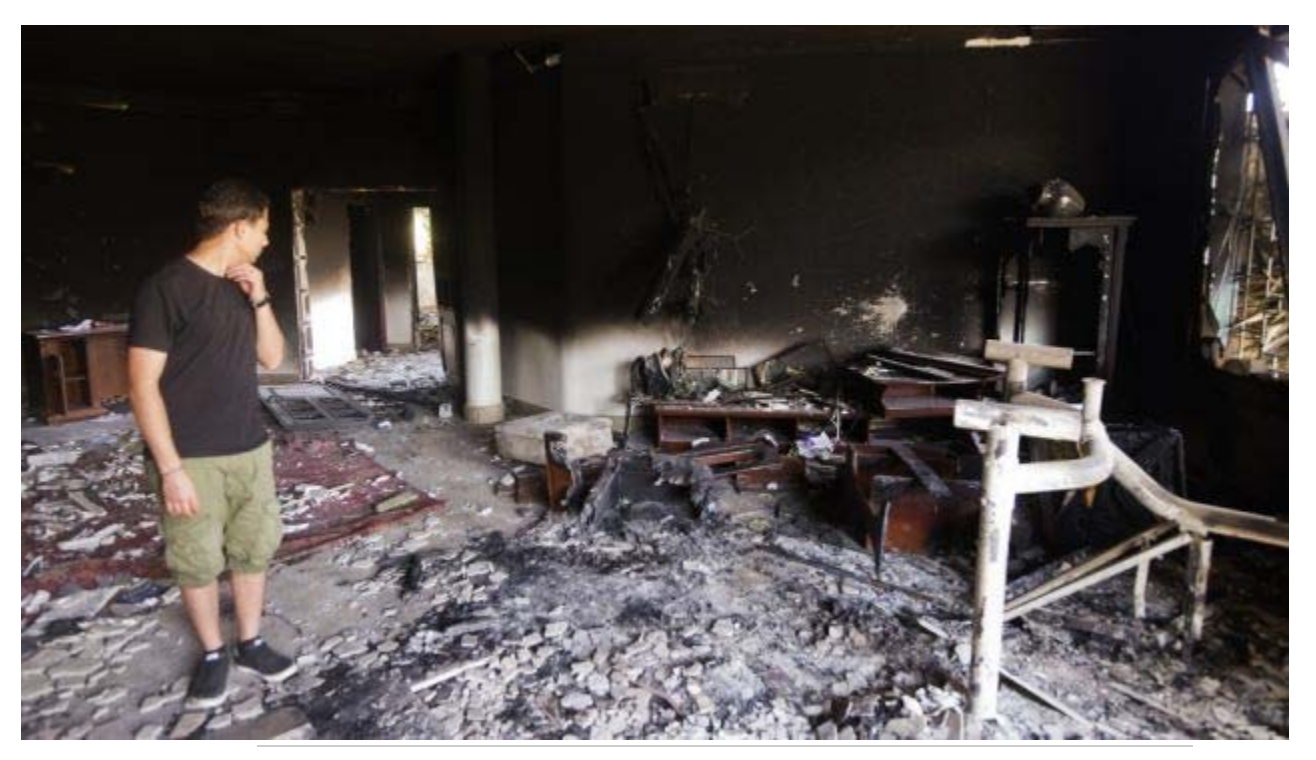
The U.S. Consulate in Benghazi, Libya was attacked and burned on Sept. 11, 2012 in a military-style attack that killed the U.S. ambassador and three other Americans

At least four surviving witnesses to the Benghazi attack have retained attorneys to help them navigate the process of testifying before Congress about what they saw. They are all employees of the CIA and the State Department, according to a Fox News report.