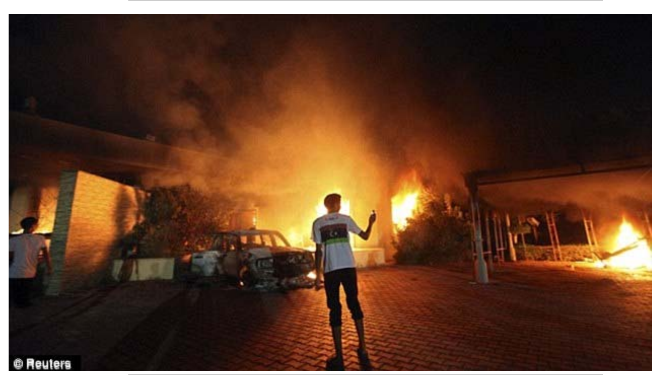
Under attack: An armed man waves takes a picture as buildings and cars are engulfed in flames after being set on fire inside the US consulate compound in Benghazi late on September 11

In addition, Panetta admitted to Senator Ayotte that there was no communication with anyone at the White House and that no one from the White House called for an update on the situation.