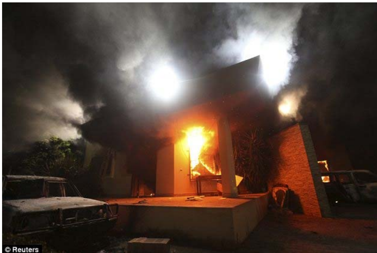
Burning issue: Ambassador Chris Stevens and three other Americans were killed in a six-hour, commando-style attack on the consulate in Benghazi

Stevens' slaying was the first of a U.S. ambassador since 1988.