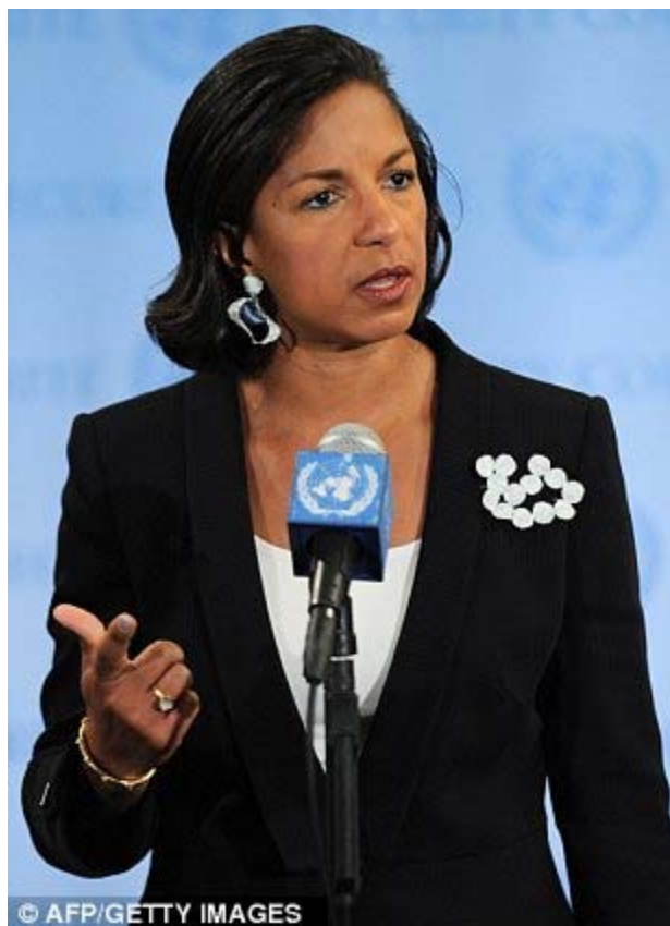
Derailed: Susan Rice appeared on numerous talk shows after the attack and used talking points linking it to the anti-Islam film

An ensuing brouhaha in the heat of the presidential campaign eventually led her to withdraw her name from consideration to replace Hillary Rodham Clinton as secretary of state in President Obama's second term.