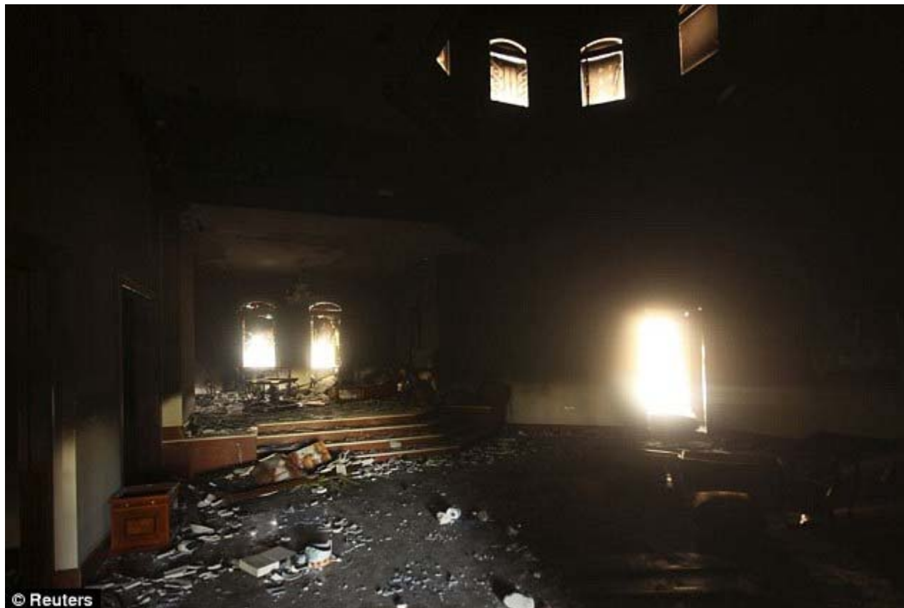
Siege: The compound came under heavy mortar and gunfire during the attack, which lasted several hours

'For many years the State Department has been engaged in a struggle to obtain the resources necessary to carry out its work with varying degrees of success,' it said.