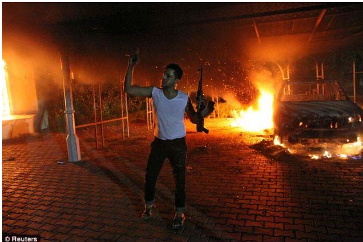
Attack: A U.S. ambassador and three other Americans were killed in the terror strike that occurred on the eleventh anniversary of 9/11

'Systematic failures and leadership and management deficiencies at senior levels within two bureaus of the State Department resulted in a Special Mission security posture that was inadequate for Benghazi and grossly inadequate to deal with the attack that took place,' the panel said.