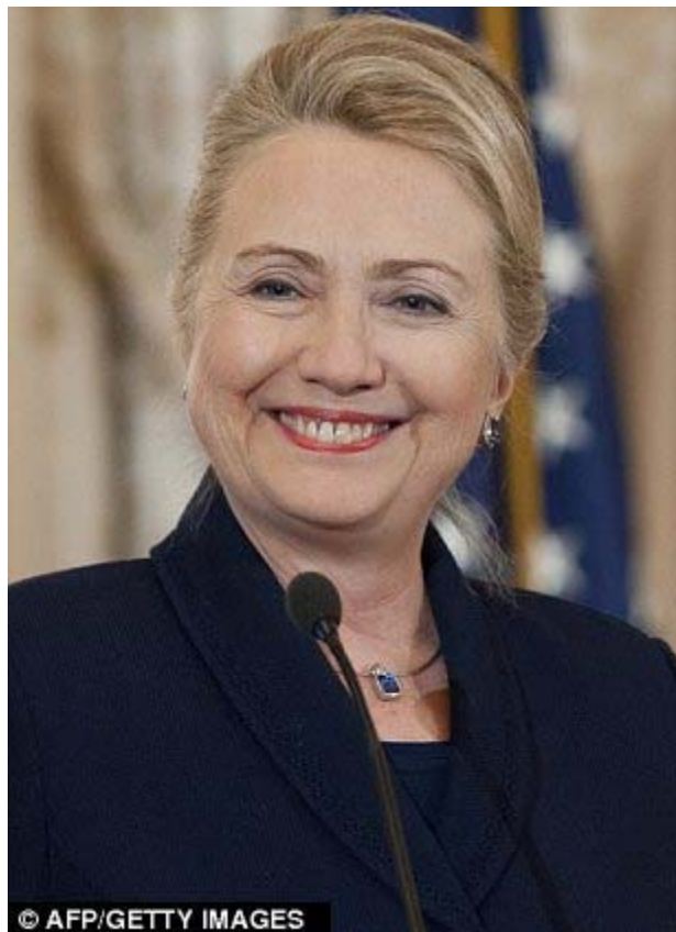
On her way out: In a letter to lawmakers, Clinton urged Congress to support the State Department's security requests

Congress has denied some funding requests from the State Department for more security.