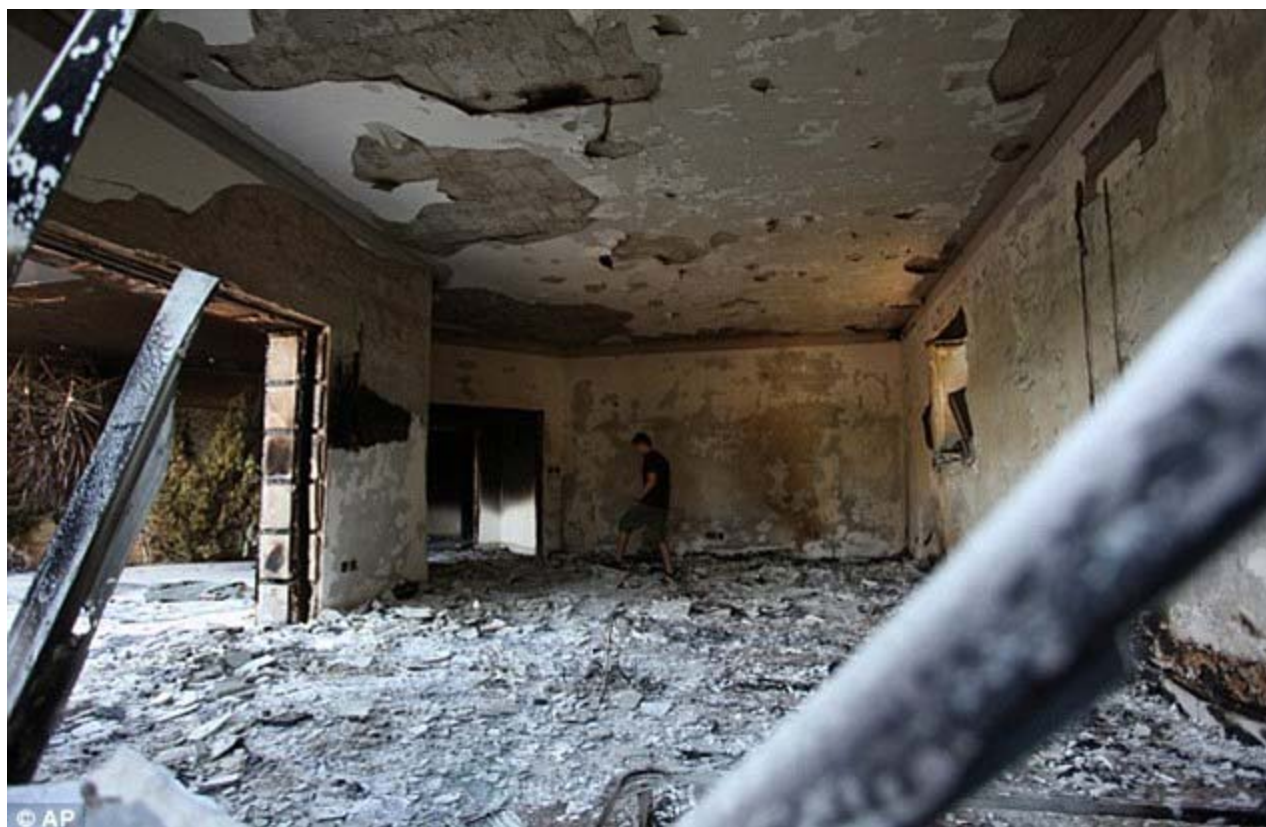
Inferno: Armed attackers dumped cans of diesel fuel and set ablaze the consulate's exterior

The report also called on Congress to fully fund the State Department's security initiative, noting that budget constraints in the past had led some management officials to emphasize savings over security despite numerous requests from the Benghazi mission and embassy in Tripoli for enhanced protection.