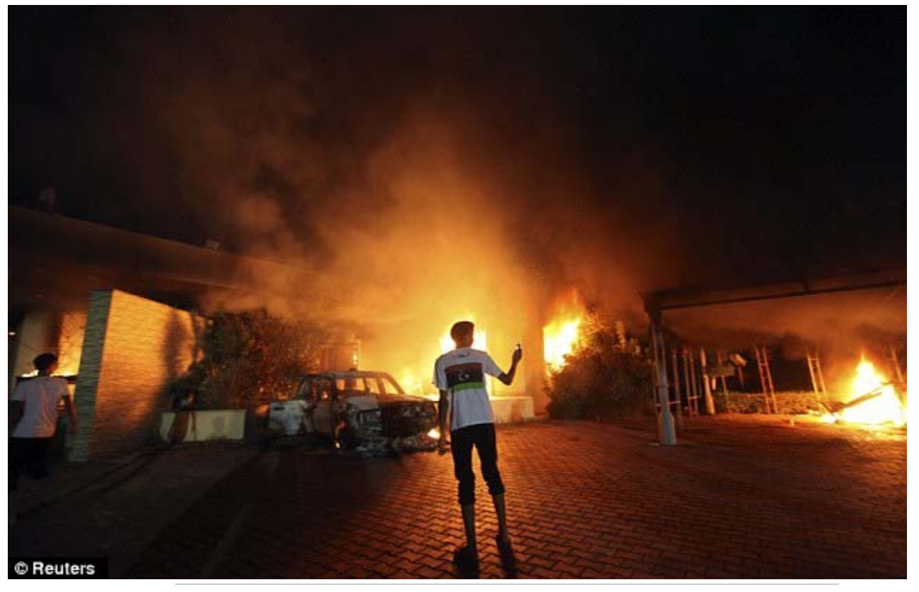
The U.S. Consulate in Benghazi was set alight during a protest by an armed group on the anniversary of September 11

He said it was too early for him to give the minute details of the attack but he said the perpetrators must have had experience.