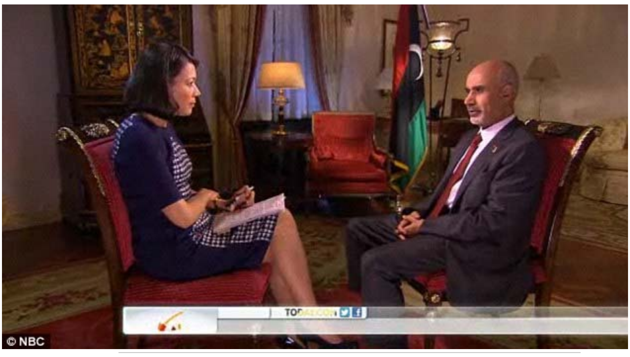
Significant: Magarief, pictured right with Ann Curry, said the fact the attack occurred on September 11 was of great significance

He added that there were no protesters at the consulate before the assault, which he told the TV station came in two waves - the first involving rocket-propelled grenades on the consulate then with mortars at a safe house.