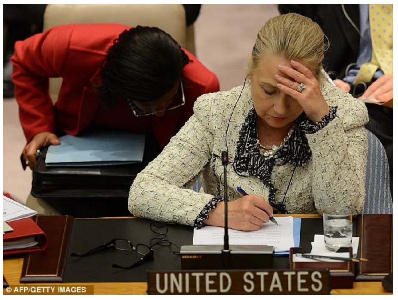
Mrs Clinton, pictured earlier attending a UN Security Council meeting on peace and security in the Middle East during the general assembly

The secretary of state did not cite any new information to make these claims, the New York Times reported.