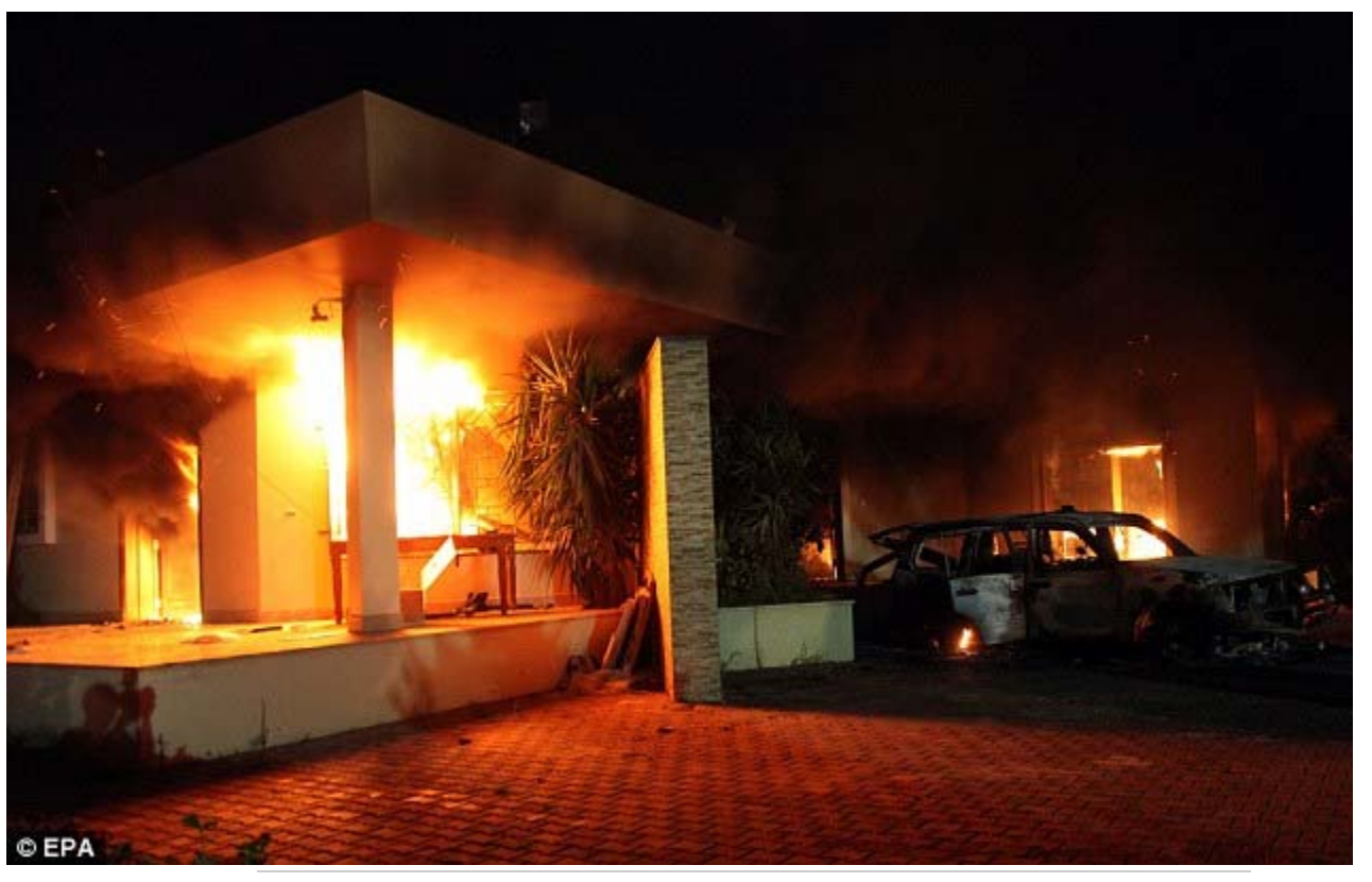
Four U.S. citizens died in the attack on the consulate in Benghazi, including the U.S. Ambassador Christopher Stevens, as well as former Navy SEALs