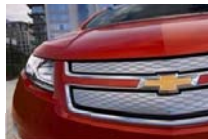
GM sold about 7,700 in 2011, below GM's target of 10,000. GM abandoned its sales target of 45,000 for 2012 last month, saying it would match "supply to demand." (GM)