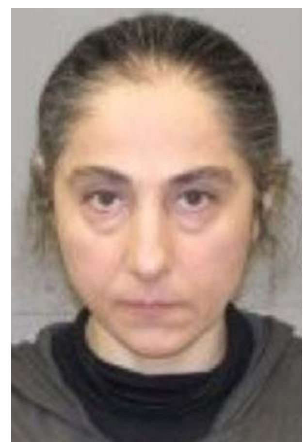
Sacked ... mum Zubeidat