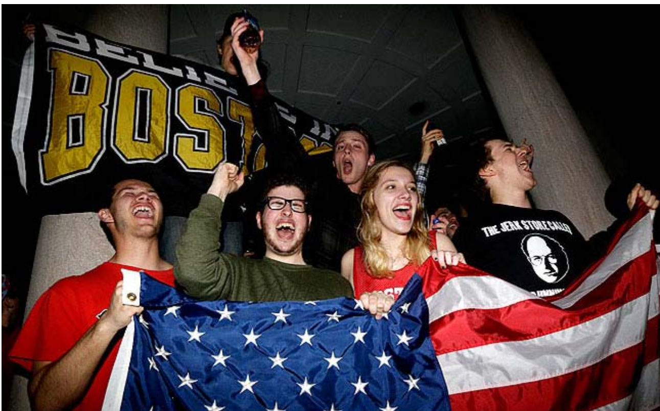
A crowd gathers at Boston Common after the final suspect in the Boston Marathon bombing was arrested in Boston.

Celebratory bells rang from a church tower. Teenagers waved American flags. Drivers honked. Every time an emergency vehicle went by, people cheered loudly.