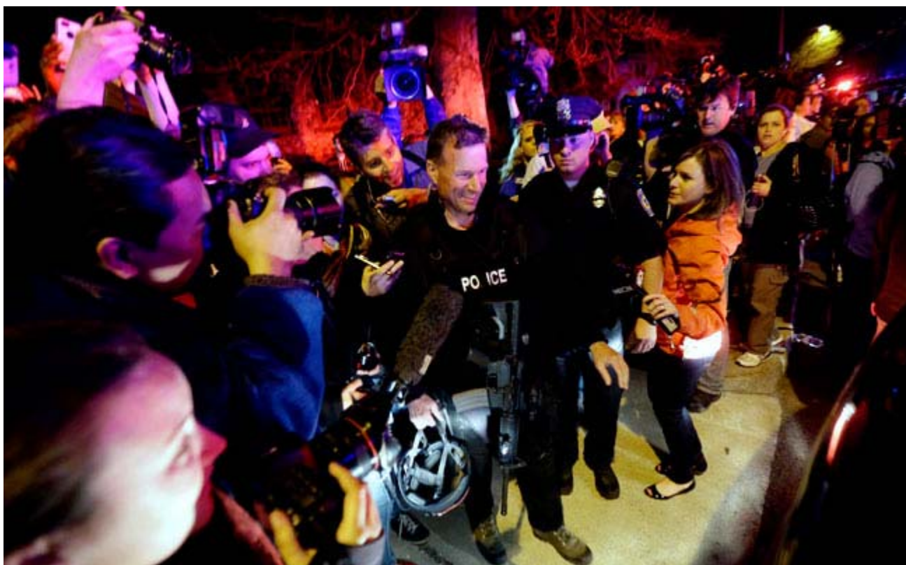
A gathering of people including the media gather around a police officer as he leaves the scene after the arrest of a suspect of the Boston Marathon bombings in Watertown.

The FBI interviewed the older brother at the request of a foreign government in 2011, and nothing derogatory was found, according to a federal law enforcement official who was not authorized to discuss the case publicly and spoke on condition of anonymity.