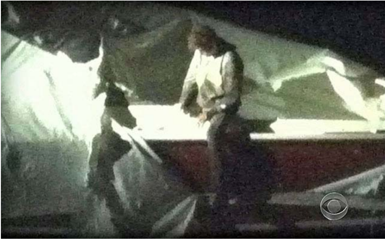
Dzhokhar Tsarnaev, a suspect in the Boston Marathon bombing who was captured after he was found hiding in a boat in a Boston suburb.

The breakthrough came when a man in Watertown saw blood on a boat parked in a yard and pulled back the tarp to see a man covered in blood, authorities said.