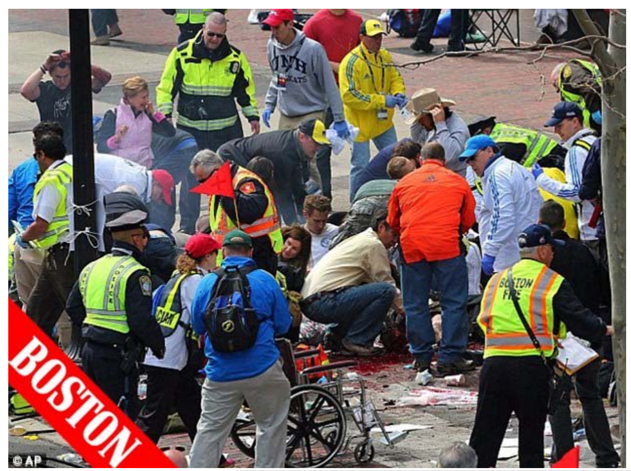
Carnage: The terrifying bomb attack at Monday's Boston Marathon took place on Patriots' Day - a New England tradition that has been marred by tragedy

But in recent years, it presents numerous grim anniversaries.