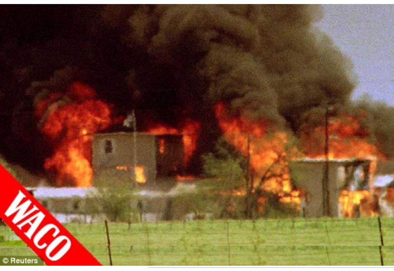
Bloodbath in Waco: The federal siege of the Branch Davidian compound, which left 82 members of the cult dead, ended on Patriots' Day in 1993

Patriots' Day is held in reverence by right-wing domestic groups, those who oppose the federal government and other mass killers who have chosen to strike on or around the third Monday in April.