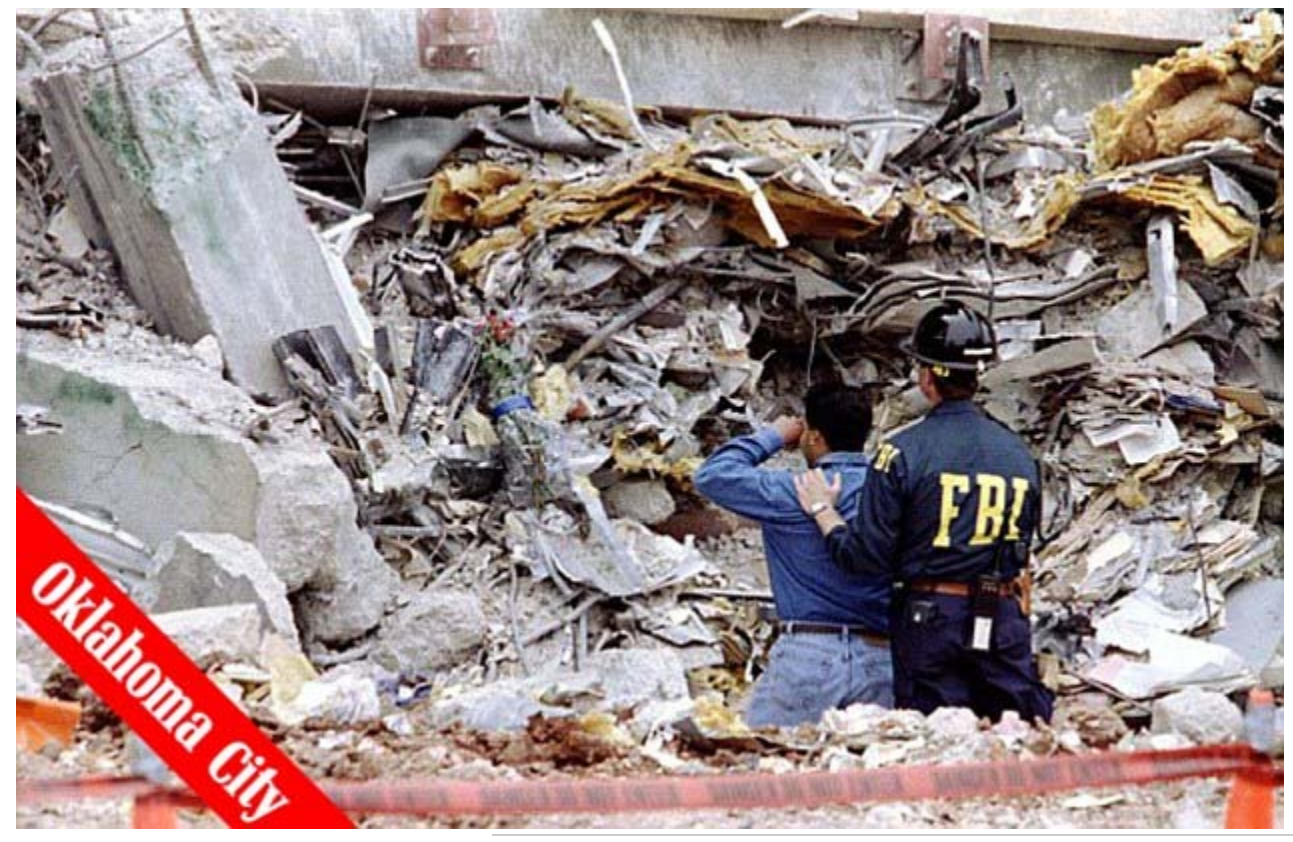
Devastation: The 1995 bombing of the Oklahoma City federal building, which killed 168, occurred the day after Patriots' Day

The 1995 bombing of the Oklahoma City federal building, which killed 168, occurred the day after Patriots' Day. Bomber Timothy McVeigh was said to believe that the date was significant.