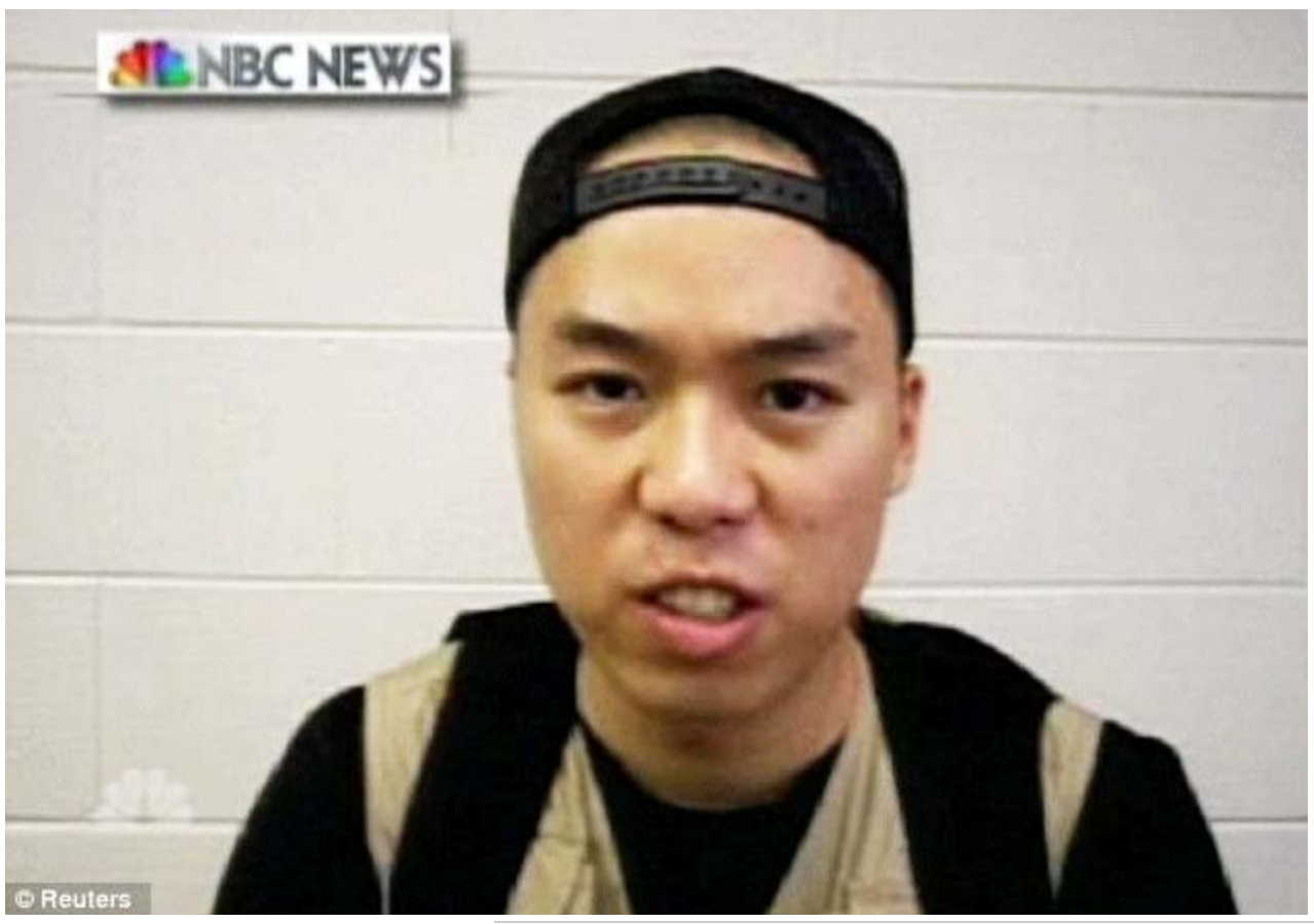
Spree killer: On April 16, 2007 - which was also Patriots' Day, Seung Hui-Cho murdered 32 people on the Virginia Tech campus before turning a gun on himself in one of the deadliest school shootings of all time

April 15 is also Tax Day, when federal income tax returns are due.