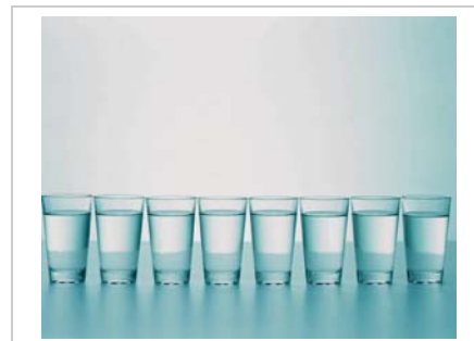
An easier way to go