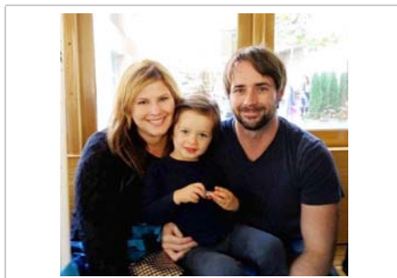
Age gap: She's old enough to be his ... wife