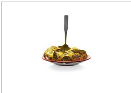
Decoding the diabetic diet