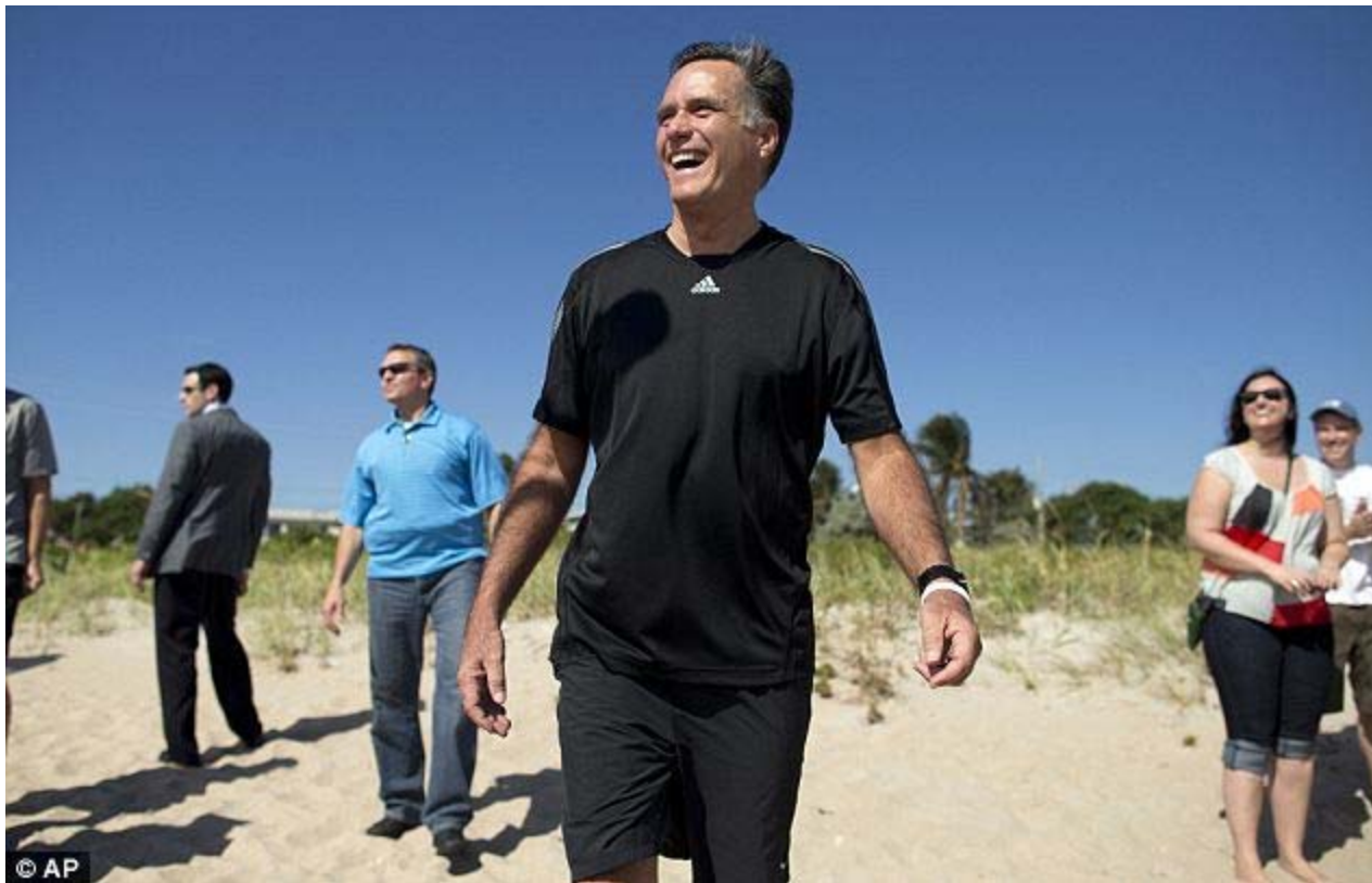
Get involved: Romney laughs as he watches a flag football game between between reporters that cover Romney, and Romney staff n Delray Beach, Florida