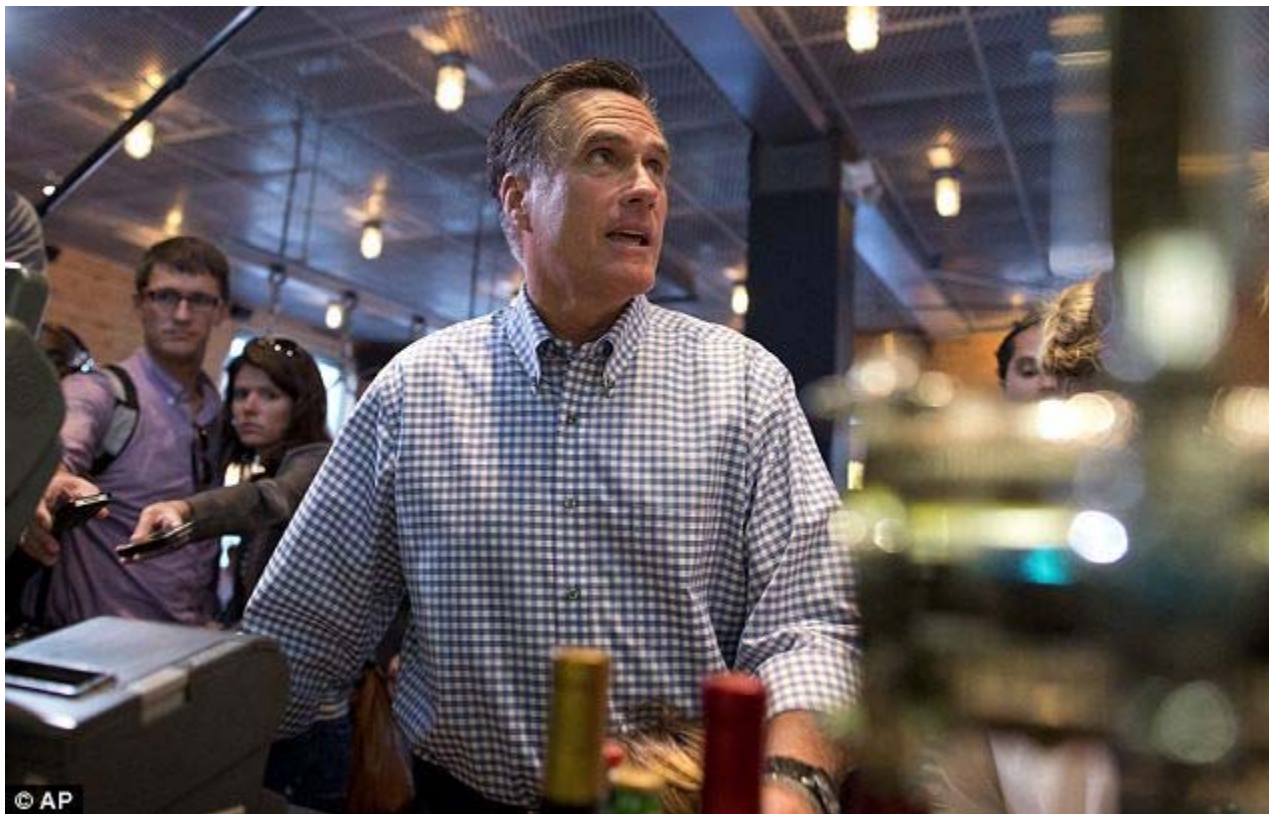
Post church veg-out: Romney looks at a menu as he orders dinner at a BurgerFi in Florida

For 2011 and 2012, Congress and Obama cut the share paid by workers from 6.2 per cent to 4.2 per cent.