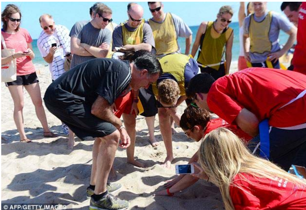
Romney tosses the coin before a friendly match of flag football

worker making $50,000 saved $1,000 a year, or a little more than $19 a week. A worker making $100,000 saved $2,000 a year.