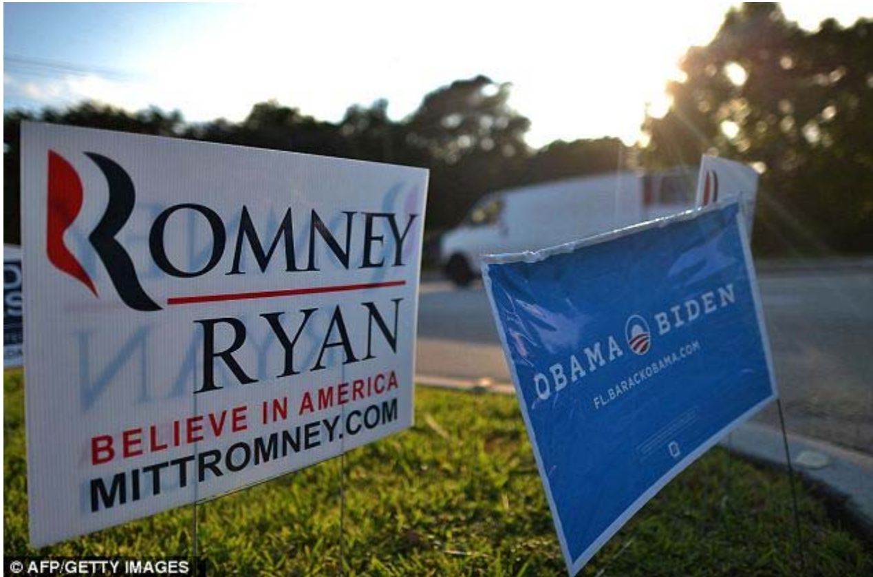
It's all to play for as the third and final presidential debate looms

A temporary reduction in Social Security payroll taxes is due to expire at the end of the year and hardly anyone in Washington is pushing to extend it.