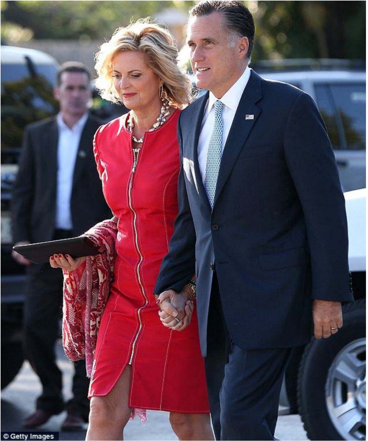
Praying for victory? Mitt and Ann Romney attend a church service on Sunday