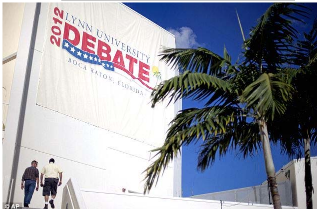
Preparation is everything: Workers enter the debate hall ahead of Monday's presidential debate

Economists were divided on the economic benefits. Many said it probably helped increase consumer spending but there was no consensus on the magnitude.