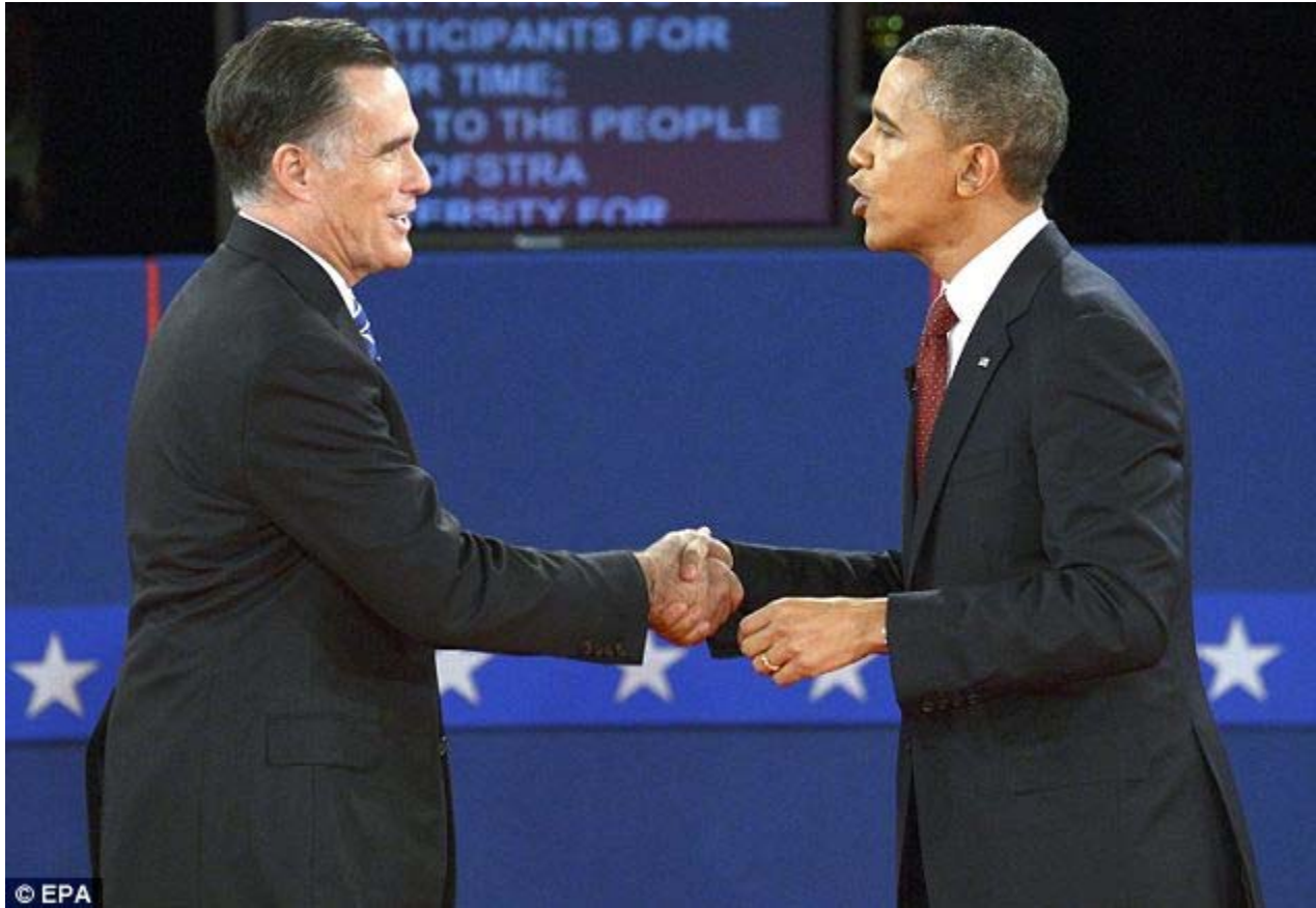
Ready for the next round? Obama and Romney shake hands at the conclusion of the 2nd presidential debate at Hofstra University in New York

Romney's campaign declined to discuss the issue.