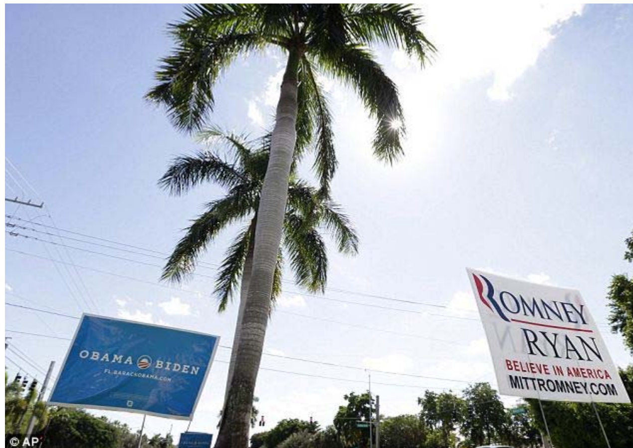
Head to head: Campaign signs are seen in a median in front of Lynn University, the site of Monday's presidential debate

Obama pushed for the tax cut in late 2010 as a way to increase workers' take-home pay to help boost consumer spending and provide a spark for the economy.