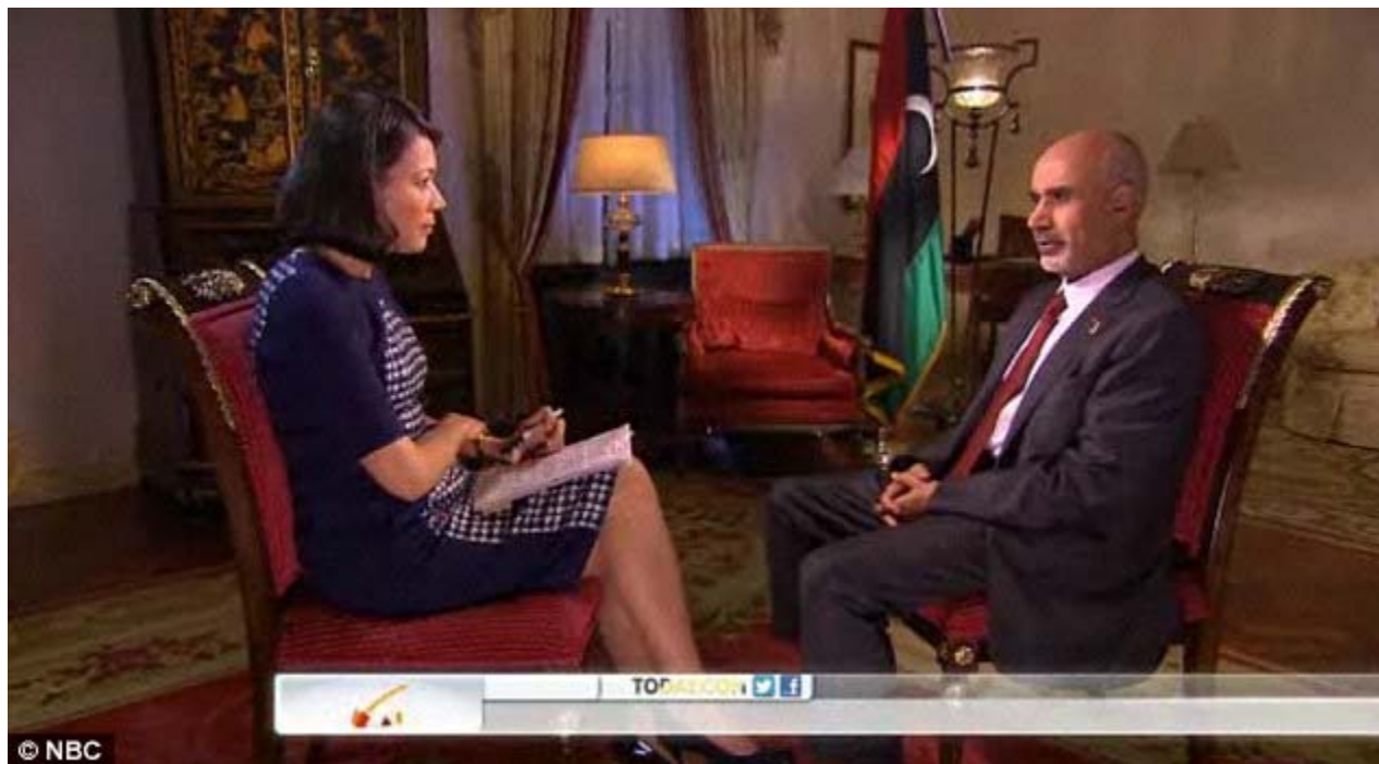
Significant: Magarief, pictured right with Ann Curry, said the fact the attack occurred on September 11 was of great significance

In the interview with NBC, Magarief said the fact the attack occurred on September 11 was hugely significant, and provided further evidence that it was orchestrated by extremists rather than spontaneous protesters.