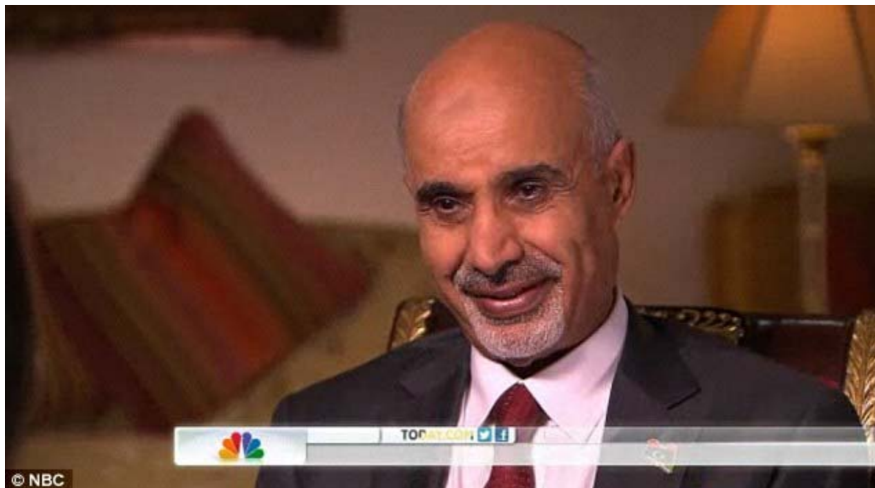
Terrorism: President Mohamed Magarief, pictured, said he had 'no doubt' the attack on the U.S. Consulate was pre-planned

'It's a pre-planned act of terrorism,' he told NBC's Ann Curry, adding that the anti-Islam film had 'nothing to do with this attack.'