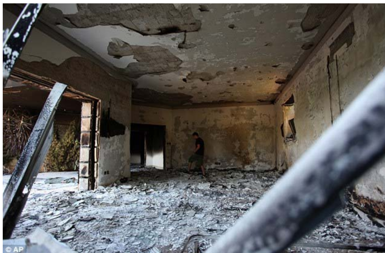
Destruction: A man walks in the rubble of the consulate after the attack that claimed four Americans

They said U.S. intelligence agencies developed leads on four of the participants within 24 hours of the fire fight that killed Stevens as well as information management officer Sean Smith and security personnel Tyrone Woods and Glen Doherty.