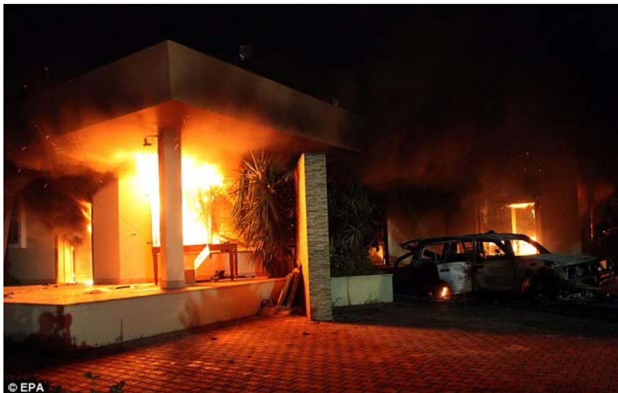
Four U.S. citizens died in the attack on the consulate in Benghazi including the U.S. Ambassador Christopher Stevens