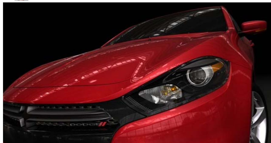
2013 Dodge Dart Compact Sedan

BY KURT ERNST | 4,490 views | Jan 5, 2012