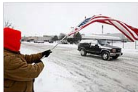
Milestones in the Carmakers' Crisis