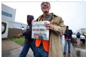
Chrysler workers outside the Warren, Mich., plant. More Photos »