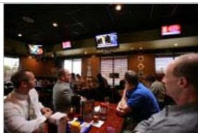
At a tavern near Chrysler offices in Auburn Hills, Mich., employees and parts suppliers watched the bankruptcy announcement. More Photos »