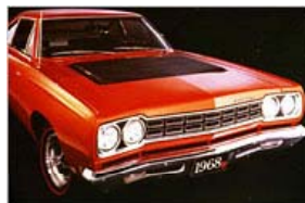
Chrysler Then and Now