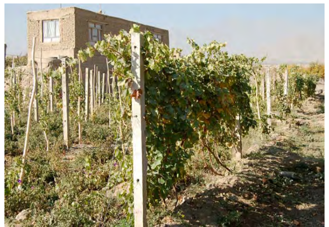
Trellised grapes at Mir Bachakot Market Center

One year was hardly enough time to reestablish international markets when starting from as rudimentary a level of production, processing, transport and association development as exists in Afghanistan. Thus, trade facilitation activities started under RAMP were resumed under ASAP. Afghan traders were linked to potential markets for grapes in Pakistan and India during the 2007 season, and are now positioned to export next season. The volume of grapes shipped to India, at some 2,100 kilograms, was small compared to shipments under RAMP, because the strategy was to offer small samples to commercial customers as examples of what could be sourced from Afghanistan in future sales, as opposed to selling off as much of the current season's harvest as possible, as was the case under RAMP.