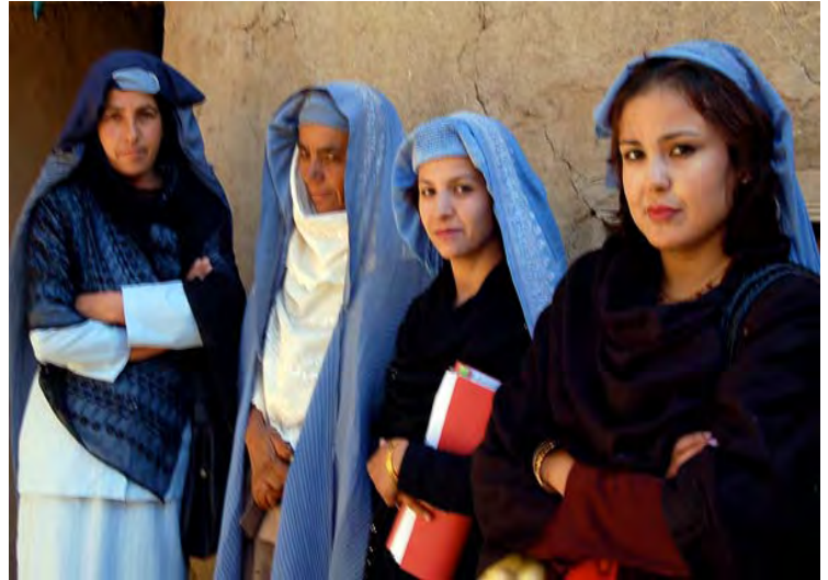
Poultry Extension Agents and Village Producer in Shomali Plain

In the poultry chain it was not possible to bring the sellers (village women) to the buyers (urban wholesalers and retailers) because most rural women do not often leave their homes, much less their villages. This market link was a critical obstacle, as increasing production would be futile if the surplus could not be brought to market consistently. The project's response was to create an exceptionally strong network of both horizontal and vertical linkages between the project's provincial supply centers and trainers, village group leaders and village producer groups. After two years, 850 producer groups had been established (there were 1020 producer groups by the end of the project); 203,926 birds had been distributed to 21,356 trainees; and 2,545,281 eggs were being marketed per month. The numbers increased and the model was working well by the end of the project. It is interesting that the project was so successful in creating the linkages in light of the difficulty encountered in the grape/raisin chain. It may have been due to gender and the willingness, even eagerness of this most vulnerable group in Afghan society—mainly widowed and otherwise impoverished women—to associate and cooperate. The strong emphasis and significant resources devoted to training, capacity building and support in organizing and encouraging the networks was also certainly critical.