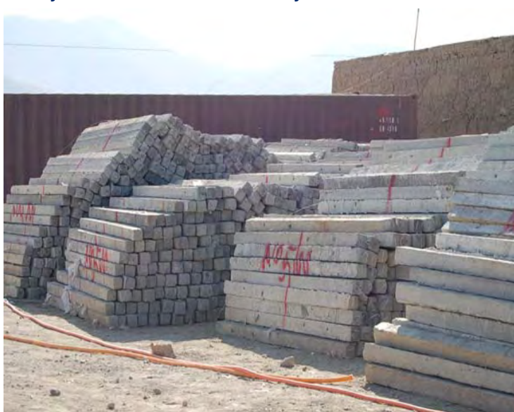
Newly Manufactured Trellises Ready for Sale

ROP intended to install trellises in demonstration plots on individual vineyards if credit could be arranged for the farmers to buy the additional trellises, but it was not able to arrange the credit. Even so, many farmers were able to buy more trellising posts. ASAP maintains RAMP's focus on promoting the wide adoption of trellising. In fact, other donors are showing interest in supporting this very successful innovation. Farmers have recognized the benefits—double and triple yields of bigger, better quality grapes, less disease and easier cultivation—resulting in growing demand for cement trellises. ASAP contracted with a Kabul cement product fabrication plant to manufacture the trellises, which they redesigned to reduce the cost of production by 25 percent over those originally produced for RAMP. These trellises were being installed at no cost on farmers' demonstration plots under RAMP, and under ASAP are being sold to farmers at 50 percent of their cost. Other subsidies used at various points in the grape/raisin value chain are listed below to give a more complete picture of where they were applied: