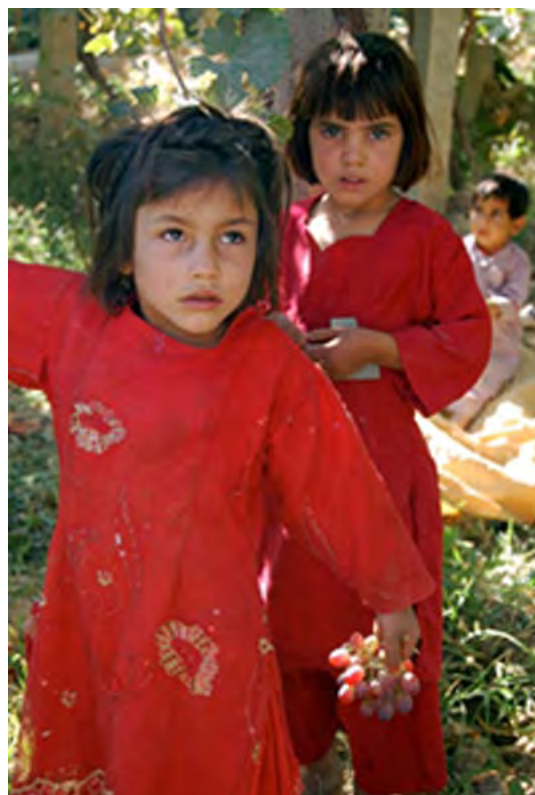
Farmer's Children in Family Vineyard

About 39 percent of farmers sell their produce at the farm gate, another 30 percent of farmers sell in their district market, 25 percent sell at the provincial market level, and 6 percent export. The 39 percent selling to traders at the farm gate have little or no access to market price information. Traders and farmers negotiate various payment schemes. Typically, a trader will come by the farm as the vines begin to fruit and offer the farmer a contract to buy at harvest time. The farmer often will get a down payment at this time, but usually will not receive full payment until after the trader has sold the grapes, and this payment will be based on the price the trader sells for, discounted for a percentage of product lost to spoilage and handling. All the risk is borne by the farmers. As might be expected, farmers complain that the traders cheat them by claiming to have received a lower price than they actually did, and/or higher spoilage. Whether this is a widespread practice or not, the fact remains that the more remote farmers have little choice but to sell to traders under the terms they dictate. This is less true of the many grape growers in the Shomali Plain who are close to the main roads and markets with access to