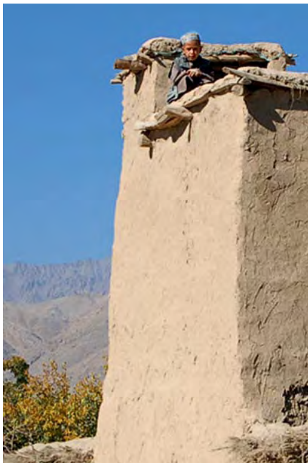
Boy in Lookout Tower Guarding Family's Fields

Despite the installation of these democratic processes and institutions, Afghanistan is still a very fragile state, with many areas still engaged in violent conflict. The International Crisis Group (ICG) reports several reasons for concern about Afghanistan's stability, addressed later in this section. The following pages look at the many underlying causes of conflict in Afghanistan and the outlook for a lasting peace.