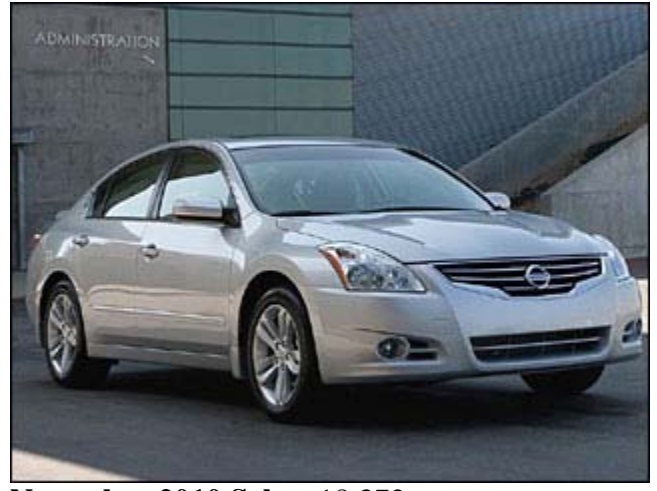
November 2010 Sales: 18,372 Change vs. November 2009: Up 13.7% MSRP: $19,900 - $30,100