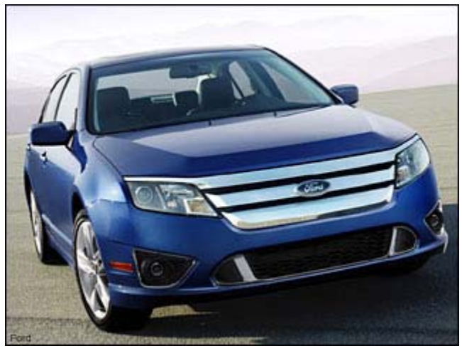
November 2010 Sales: 18,412 Change vs. November 2009: Up 22.8% MSRP: $19,720 - $28,645