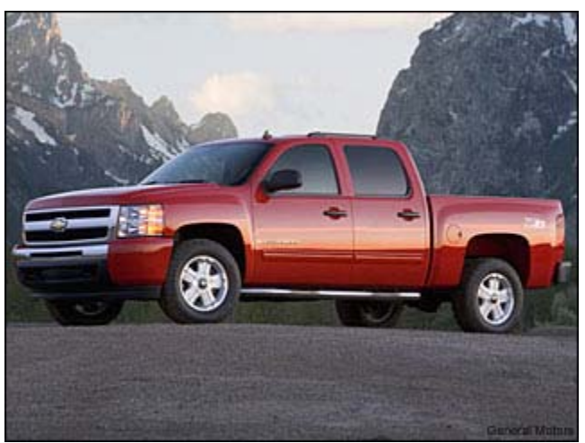
November 2010 Sales: 25,619 Change vs. November 2009: Up 11.1% MSRP: $20,850 - $41,775