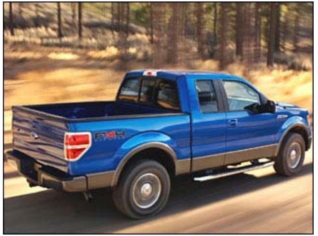
June 2010 Sales: 38,541 Change vs. June 2009: Up 21.1% MSRP: $22,415 - $51,140