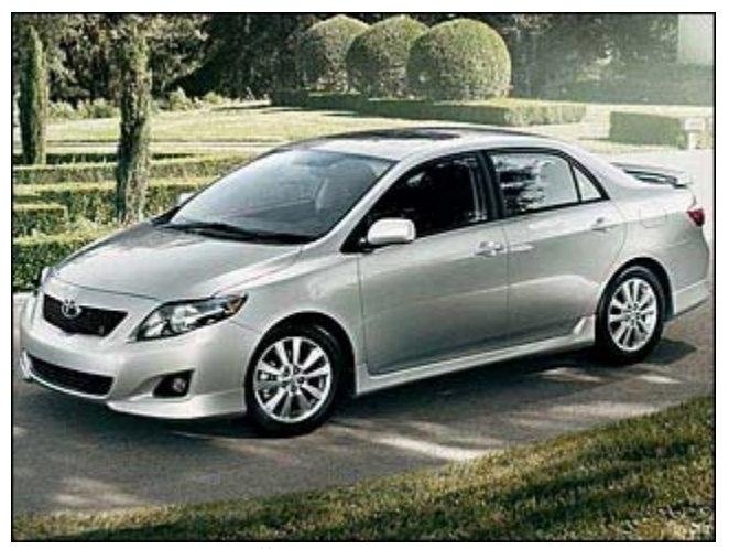
November 2010 Sales: 16,202 Change vs. November 2009: Down 29.1% MSRP: $15,450 - $18,960