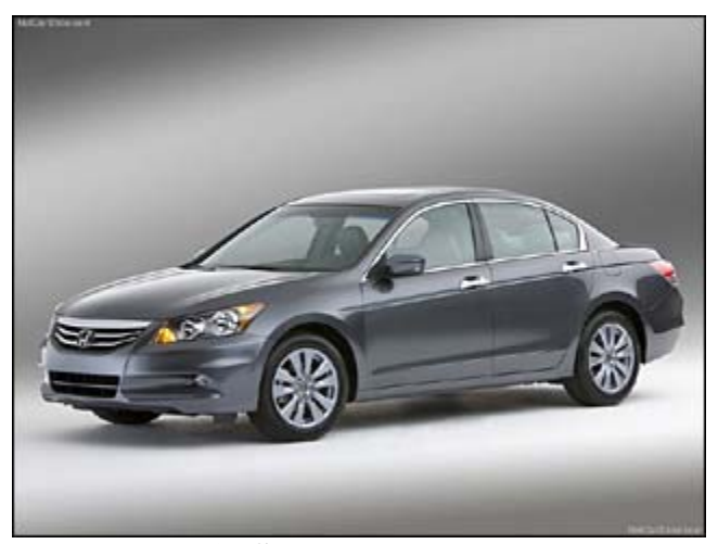
November 2010 Sales: 16,795 Change vs. November 2009: Down 3.9% MSRP: $21,180 - $29,730