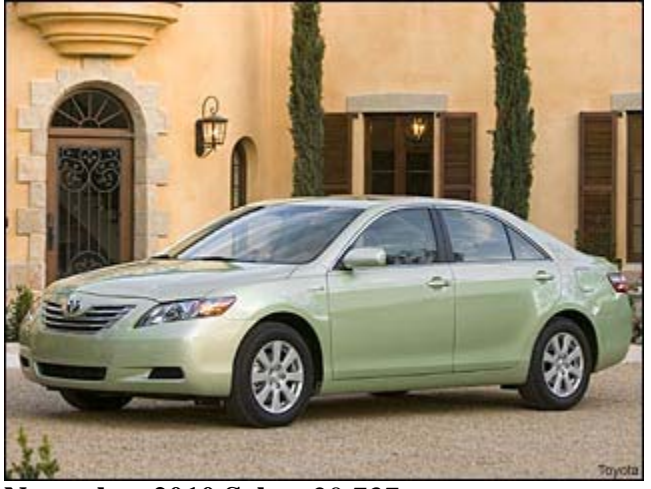
November 2010 Sales: 20,737 Change vs. November 2009: Down 27.4% MSRP: $19,720 - $29,370