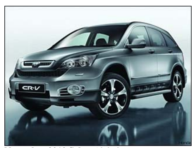
November 2010 Sales: 18,263 Change vs. November 2009: Up 25.4% MSRP: $21,695 - $27,895